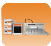
Automated Prep-Flash Chromatography system