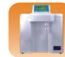
Water purification system