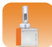
Optima Gas Chromatograph